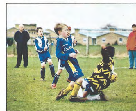
Under 8's in action against Chippenham Youth