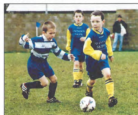
Under 7's in action against Chippenham Youth