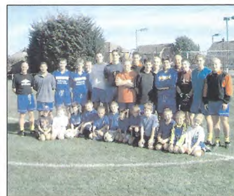
Under 9's & 10's with the Reserves