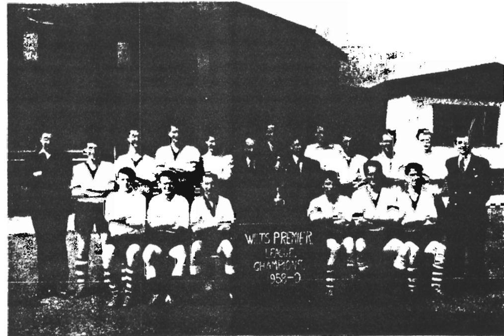
Proud winners - The Swindon BR side of 1958/59 who are planning a reunion