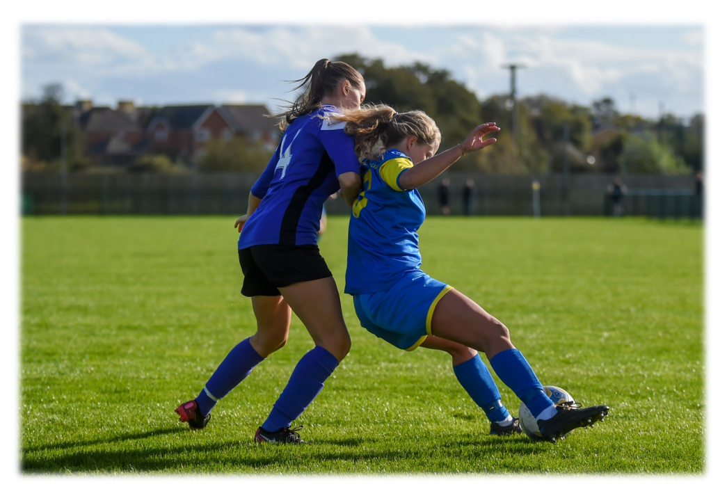
Action from last week's FA Cup game