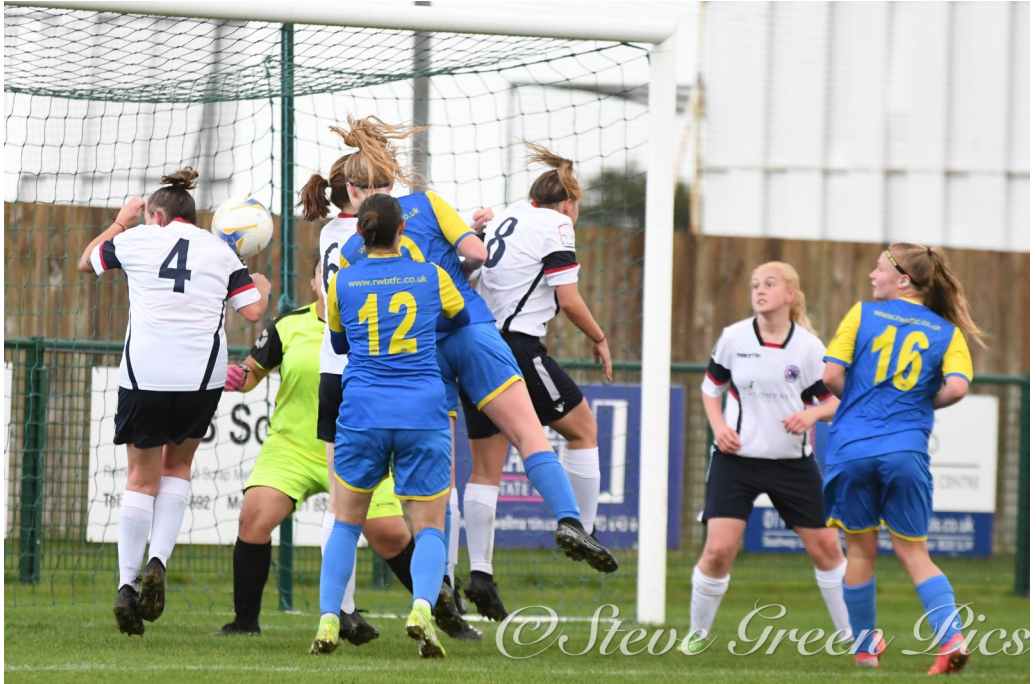
Action from last week's FA Cup game against Denham United Ladies.