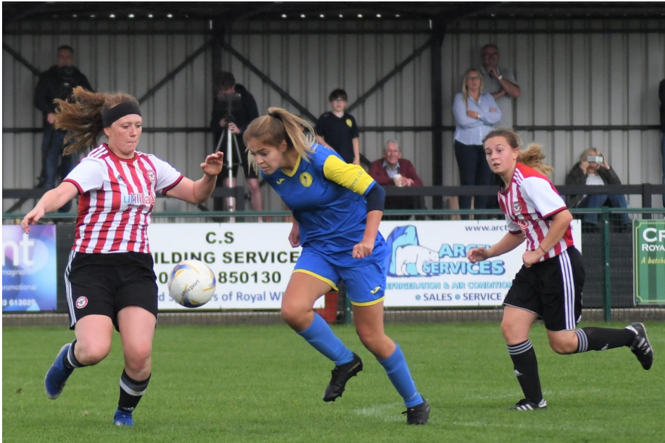
Action from last season's Extra Preliminary Round exit at the hands of Brentford.